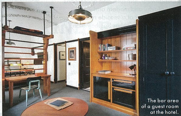
The bar area of a guest room at the hotel.

➔ MURIEL BRANDOLINI'S LIFESTYLE LAUNCH p. 28 AN EPIC OF MODERN INDIA p. 29 BODY AND SEOUL: THE KOREAN BEAUTY TREND p. 30