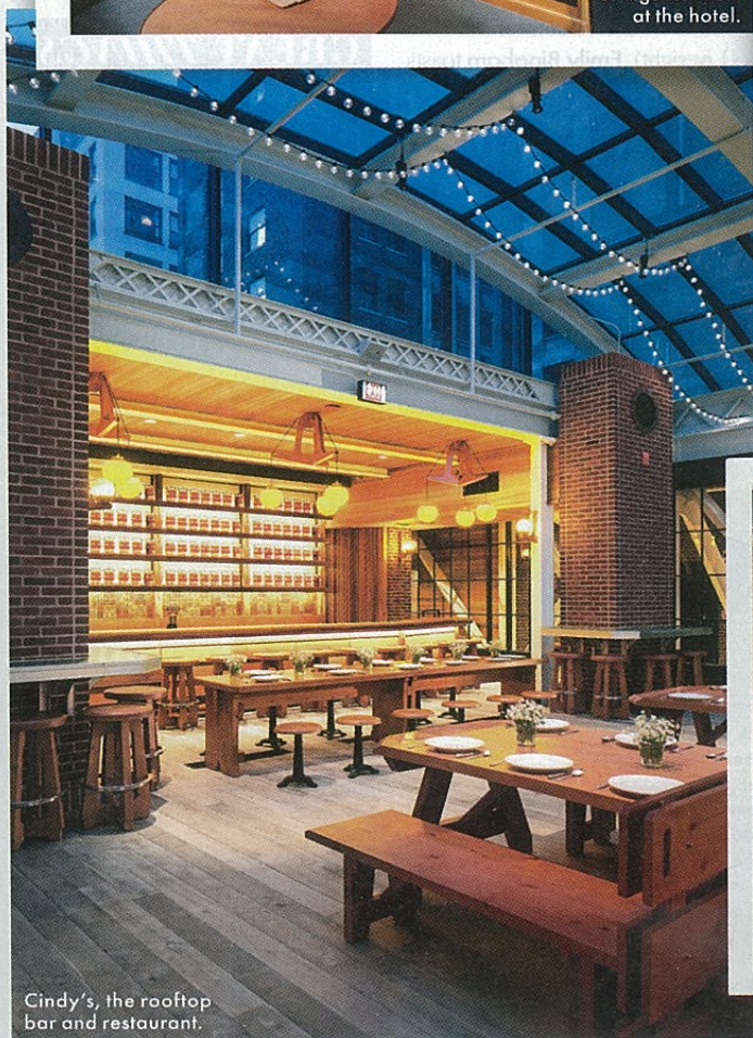
Cindy's, the rooftop bar and restaurant.