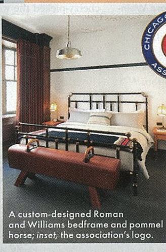
A custom-designed Roman and Williams bedframe and pommel horse; inset, the association's logo.