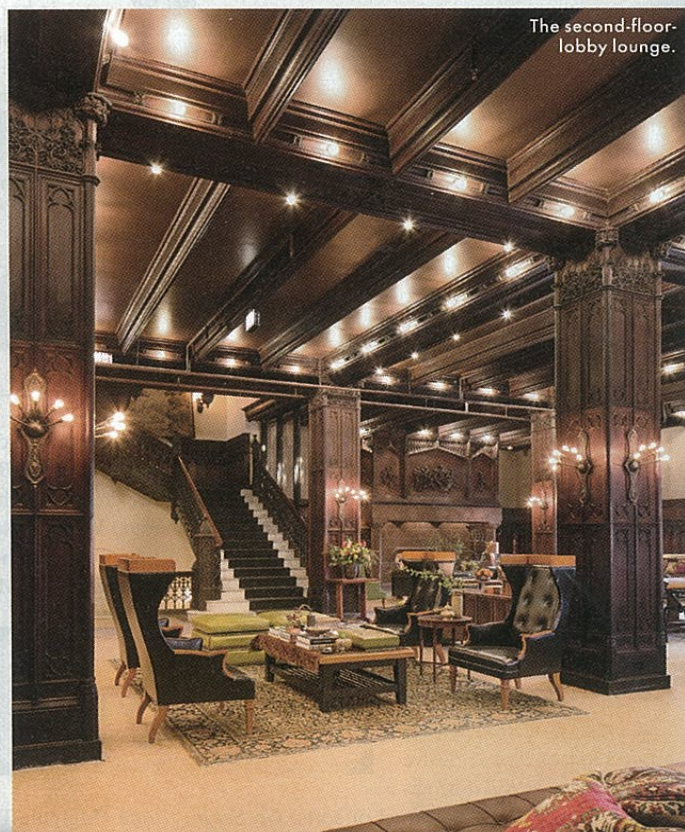
The second-floor lobby lounge.